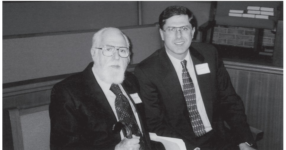
With my father in 1998 at a conference in Tampa Bay, Florida.

After all, Scripture begins with creation, and it ends with a picture of the eternal kingdom, so Scripture gives us a history of God calling man back to Himself and His perspective—on how