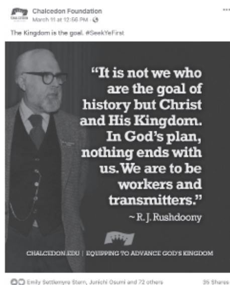
Rushdoony quotes beat Facebook's algorithm!

What greater agenda is there? Is not the Kingdom of God the primary purpose behind all theology and