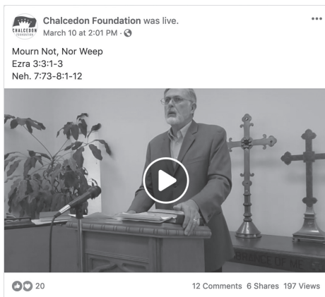
Watch Chalcedon Chapel Services live!