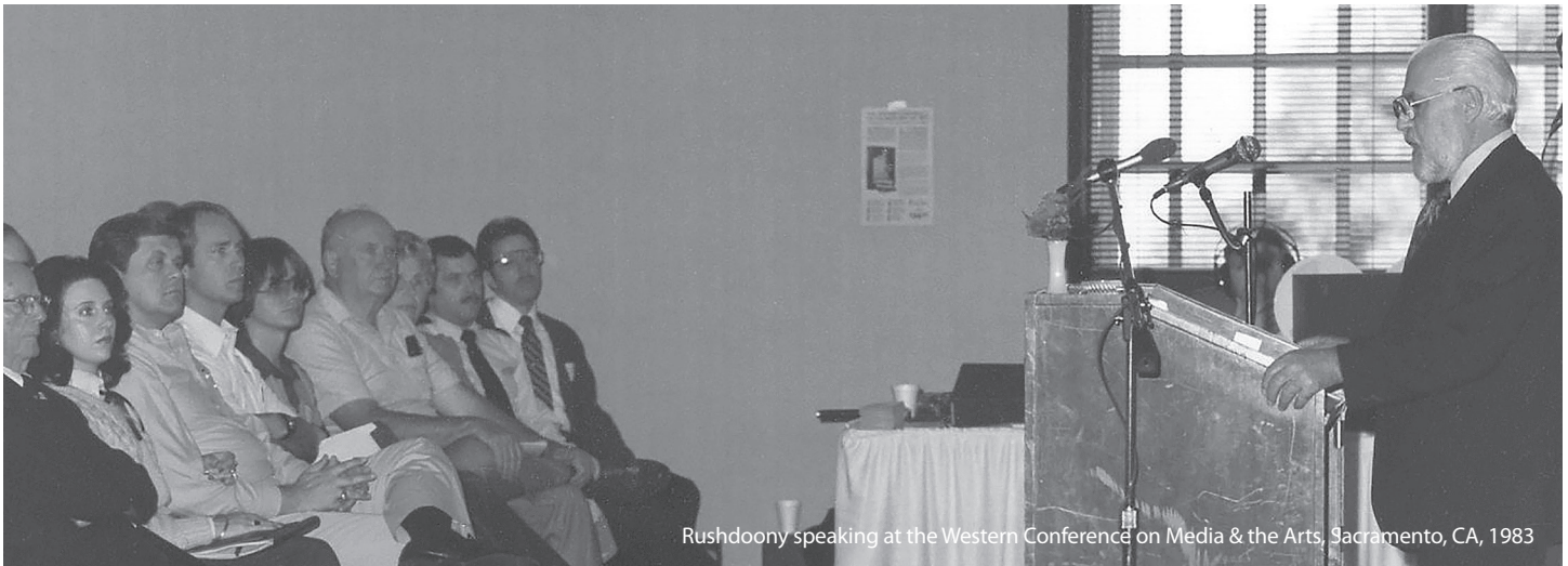
Rushdoony speaking at the Western Conference on Media & the Arts, Sacramento, CA, 1983